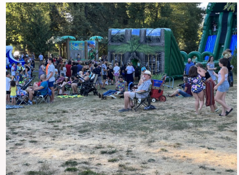
Top Left: Paradise of Samoa Fire Dancers—Top Right: Paradise of Samoa band—Bottom Left: View of the food court! - Bottom Right: Inflatable ziplines were a hit!