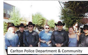
Carlton Police Department & Community

Hot Dogs/Hamburgers/Barbequed Pork Child Identification Booth Carnival Rides National Guard Rock Wall Cotton Candy YCTC Games and Activities Horse Rides (Fitzgerald Farms)