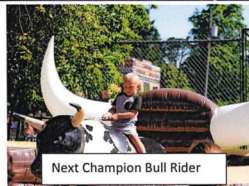
Next Champion Bull Rider