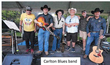
Carlton Blues band

“Police & Community Together “Samoa & Hawaiian Island Style”