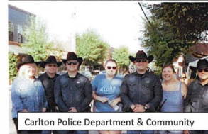
Carlton Police Department & Community

Hot Dogs/Hamburgers/Barbequed Pork Child Identification Booth Carnival Rides National Guard Rock Wall Cotton Candy YCTC Games and Activities Horse Rides (Fitzgerald Farms)