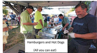
Hamburgers and Hot Dogs (All you can eat)