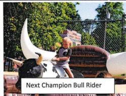
Next Champion Bull Rider