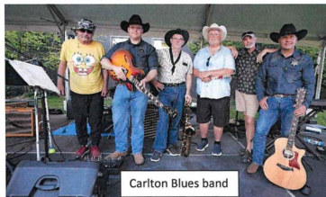
Carlton Blues band

“Police & Community Together “Samoa & Hawaiian Island Style”