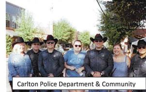
Carlton Police Department & Community

Hot Dogs/Hamburgers/Barbequed Pork Child Identification Booth Carnival Rides National Guard Rock Wall Cotton Candy YCTC Games and Activities Horse Rides (Fitzgerald Farms)