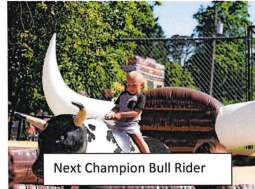
Next Champion Bull Rider