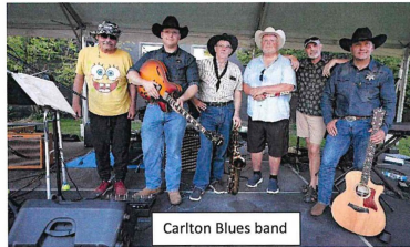
Carlton Blues band

“Police & Community Together “Samoa & Hawaiian Island Style”