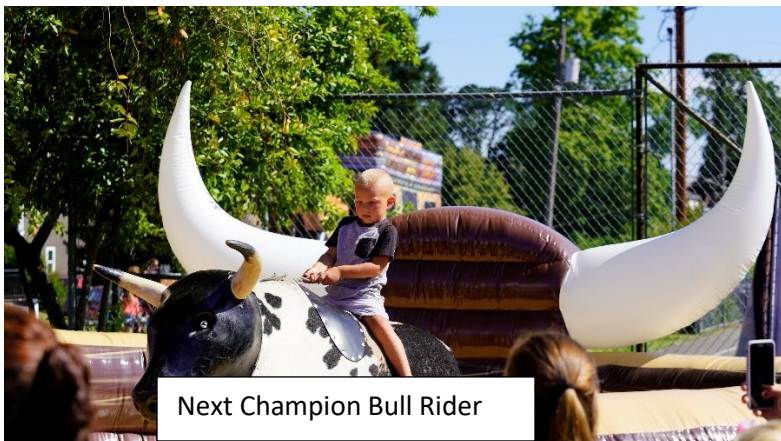
Next Champion Bull Rider