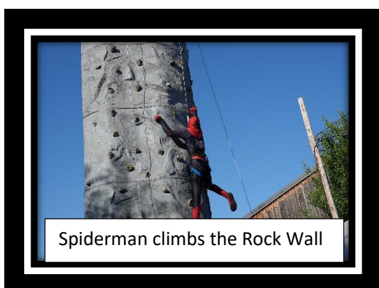
Spiderman climbs the Rock Wall