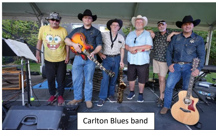
Carlton Blues band

“Police & Community Together “Caribbean Style”