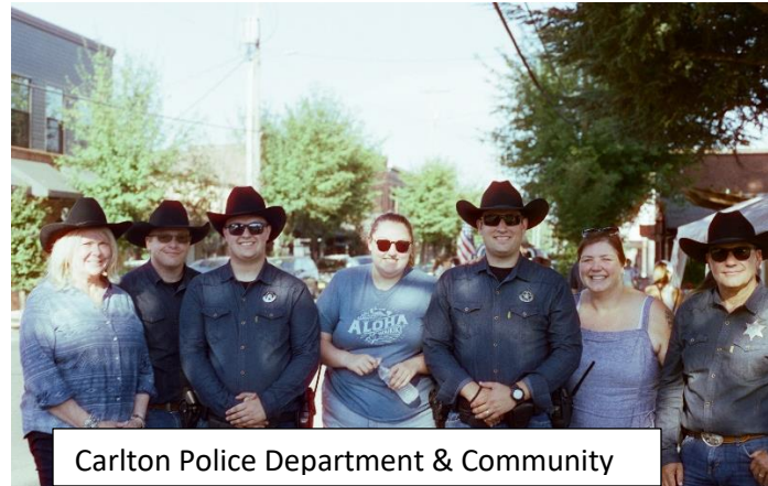
Carlton Police Department & Community