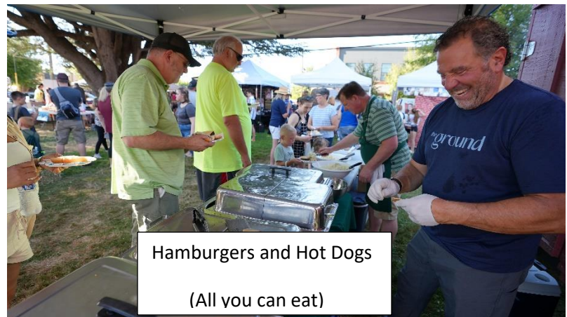
Hamburgers and Hot Dogs (All you can eat)