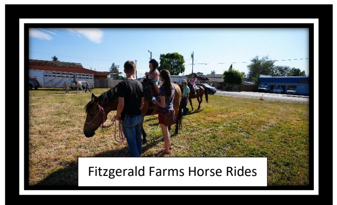
Fitzgerald Farms Horse Rides