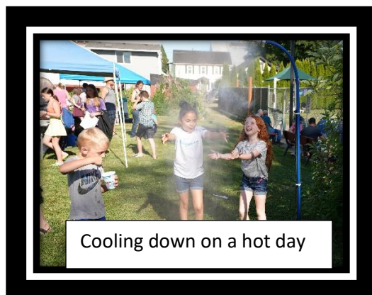
Cooling down on a hot day