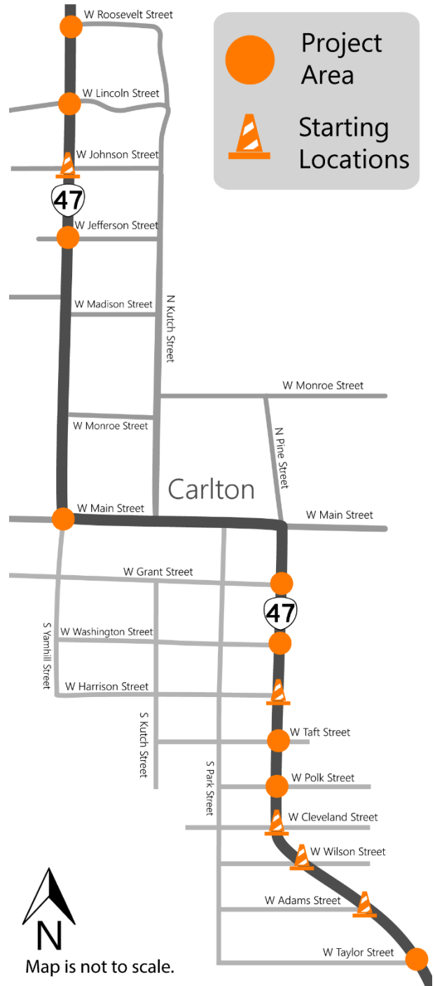
Curb Ramp Upgrades

Visit TripCheck.com for the most up to date information on traffic and impacts.