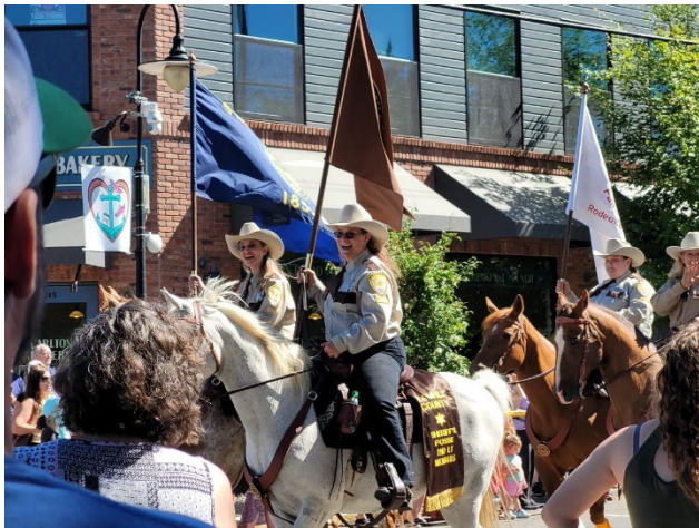
Carlton Fun Days Parade 2022

Total Traffic Stops June 22 – 29, 2022: 10