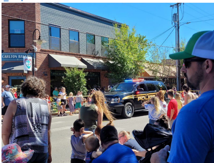
Carlton Fun Days Parade 2022