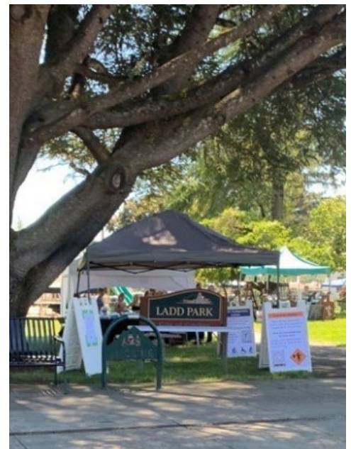
ODOT materials at Carlton Fun Days event.