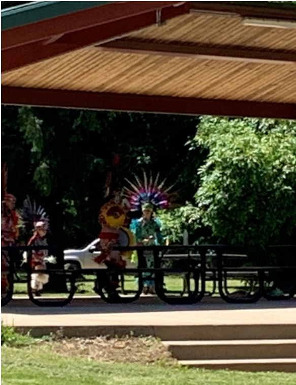
Photo from the Danza Azteca Performance on Thursday, June 23 rd . This was an event hosted by the Cities of Dayton Library and Carlton. Danza Azteca teaches indigenous Aztec culture and tradition through dance, music, and arts.

Free books were given out to the children in attendance.