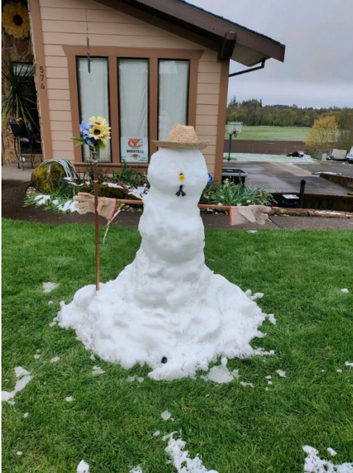
A surprise snowman from the historic April 11 th Snowstorm