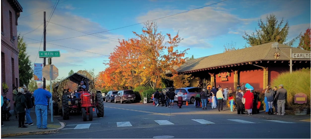
Thank you, Carlton Business Association for the Spooky Parade!