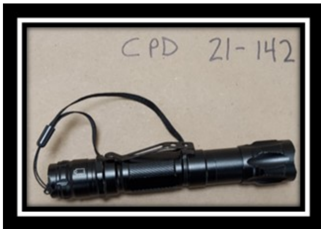
Laser Pointer Device