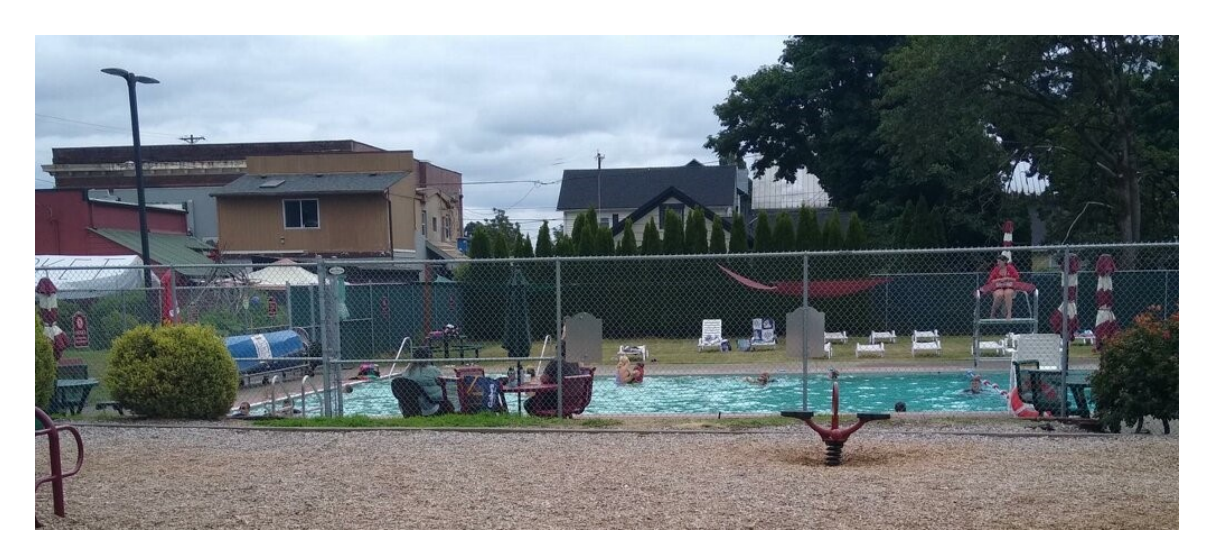
The Pool is OPEN!!!