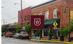
Review Carlton's crime statistics.