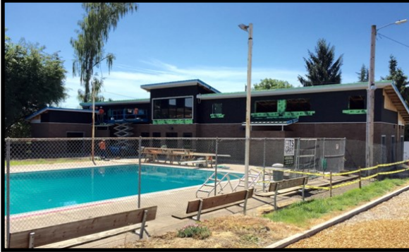
Carlton Community Pool during construction