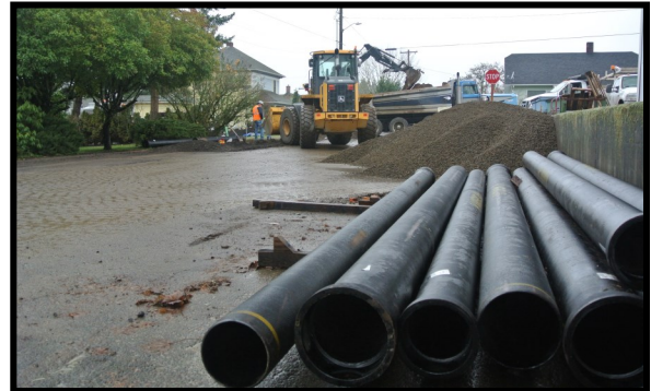
Water Distribution Lines, 12/2015