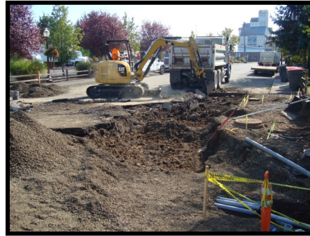
Monroe Street Reconstruction, 10/2015