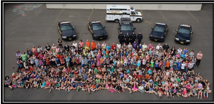
Police & Youth Photo, 05/2016