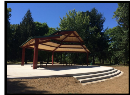
New Picnic Shelter Lower Wennerberg Park, 08/2016