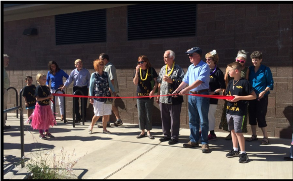
Pool House Ribbon Cutting Ceremony, 08/2016