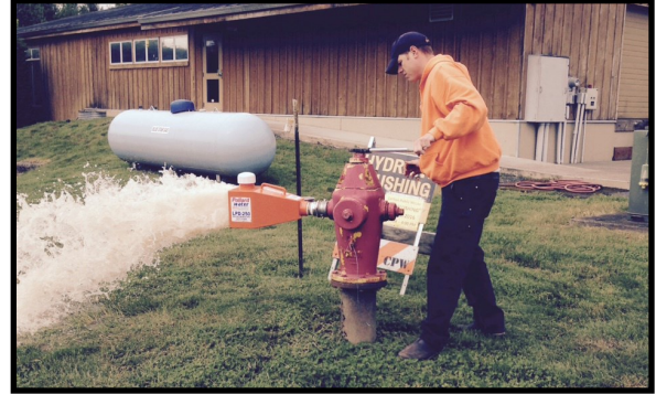
Fire Flow Testing